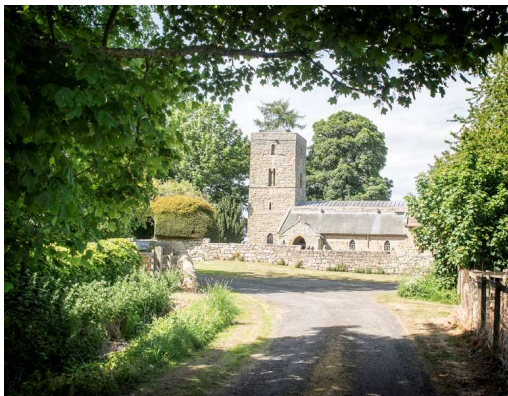
St Andrew's, Bolam

All our beautiful and peaceful church buildings are listed Grade I except for St Giles which is Grade II*. Some churchyards also have listed headstones. All the churches have history, some dating back over 900 years of Christian worship. Their condition varies from very reasonable to good with various legacies and grants which have helped with maintenance. All churches have churchyards, only Hartburn is essentially full but there is plenty of space at its Chapel of Ease, St John, Meldon. Each parish has prepared a profile and they can be viewed at: www.upperwansbeckchurches.weebly.com