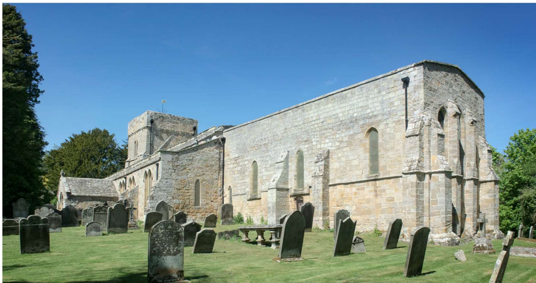
St Andrew's, Hartburn