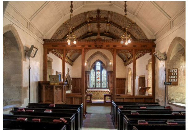
St John's, Meldon