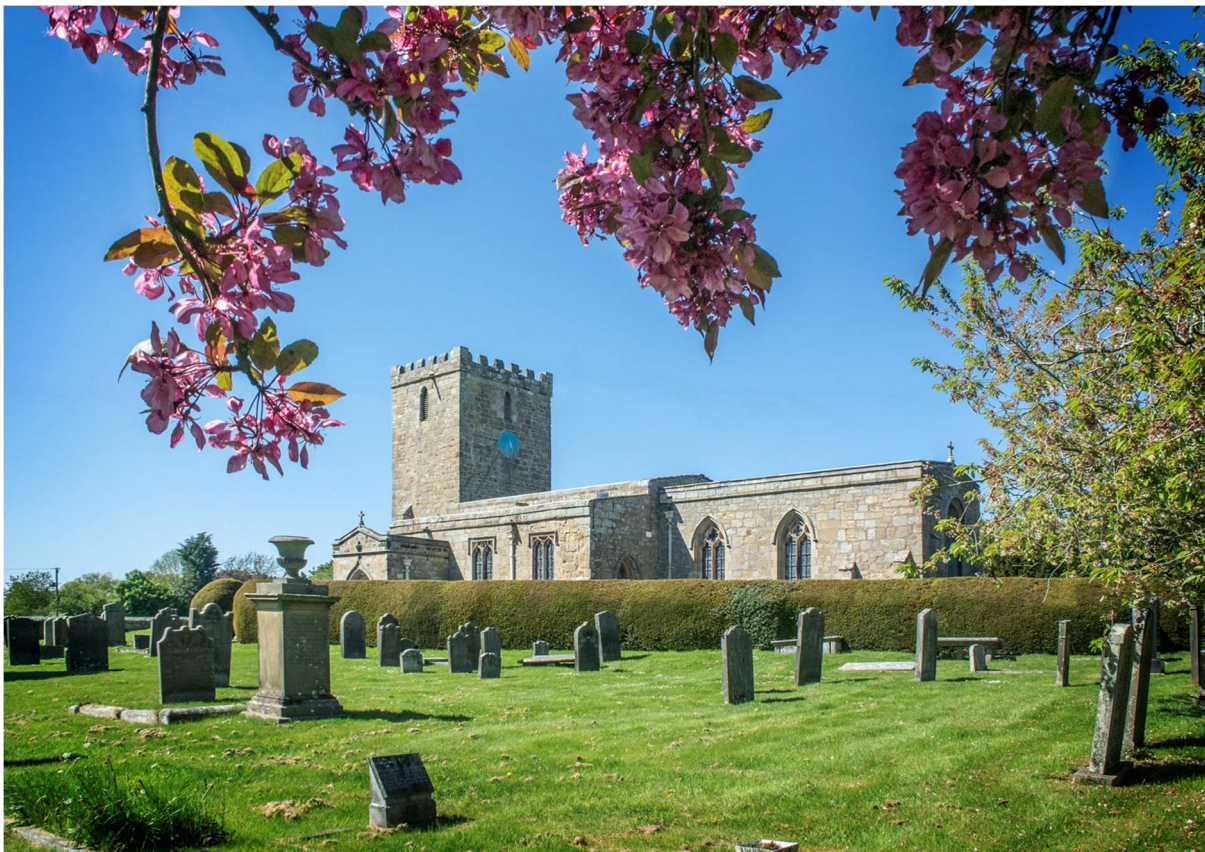
St Mary Magdalene, Whalton