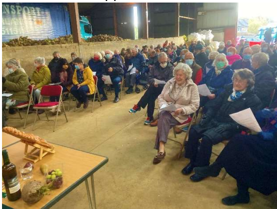
annual Harvest In The Barn is a collaboration between the HCA and the church family. This

The benefice is committed to reaching out to our local communities and so we endeavour to be involved and support all social events in both parishes. In Mitford, we support the community centre and attend events they instigate ie coffee mornings, summer fair, carol singing in the local pub called the Plough. Hebron's church building is also the Village Hall, used by the Hebron Community Association (HCA), who have regular social events during the year beginning with Burns Night – Summer Concert, Ciderfest at harvest time and Christmas music events. The church family are involved and support all these events.